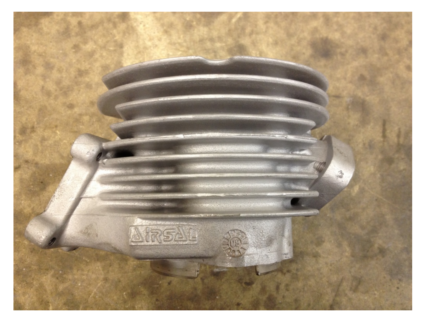
As with other RB cylinders they are marked with Airsal