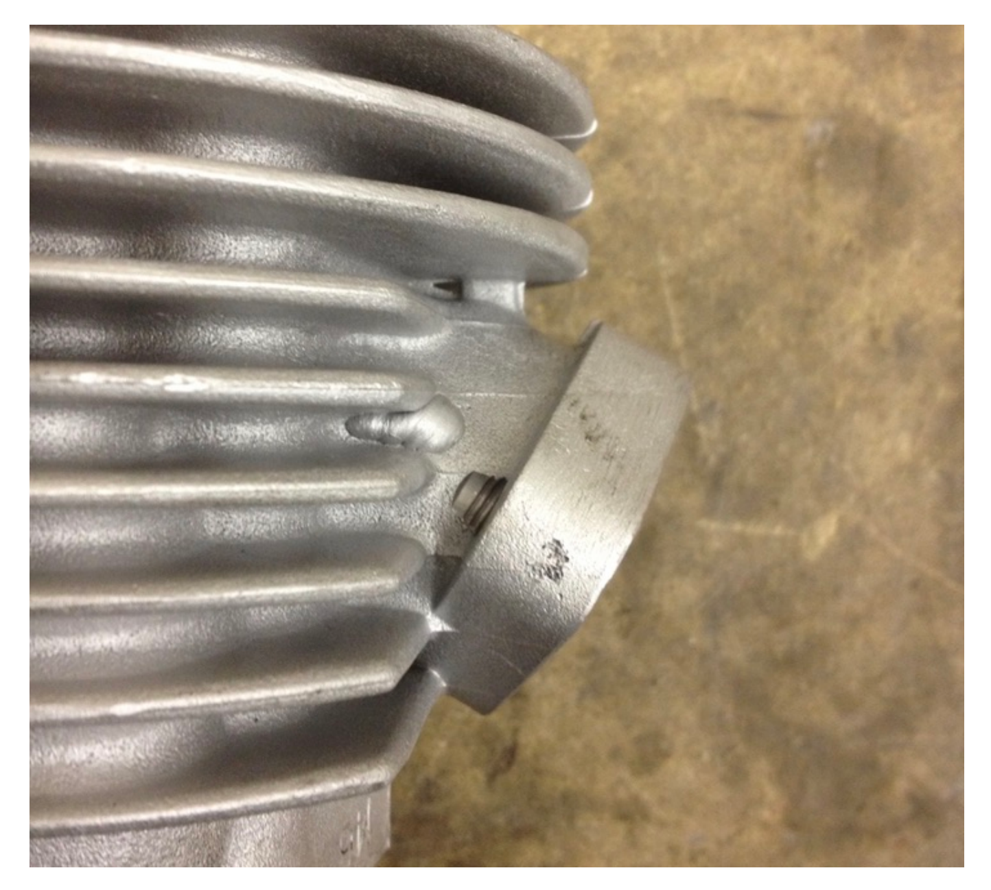
Same slopped exhaust port shape, needs a special exhauast